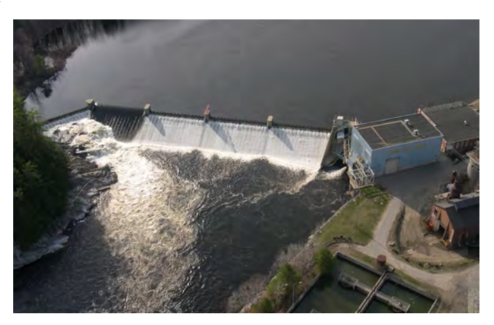
Pejepscot Dam

The appeal was brought over DEP's failure to accommodate the democratic process that over several years upgraded the lower Androscoggin River classification through the state's Triennial Review, from a previous minimum Class C to the higher Class B. Had the approved Certification gone unchallenged it would have become part of a 40 year Federal Energy Regulatory Commission (FERC) hydropower license, setting a dangerous and unpredictable precedent for