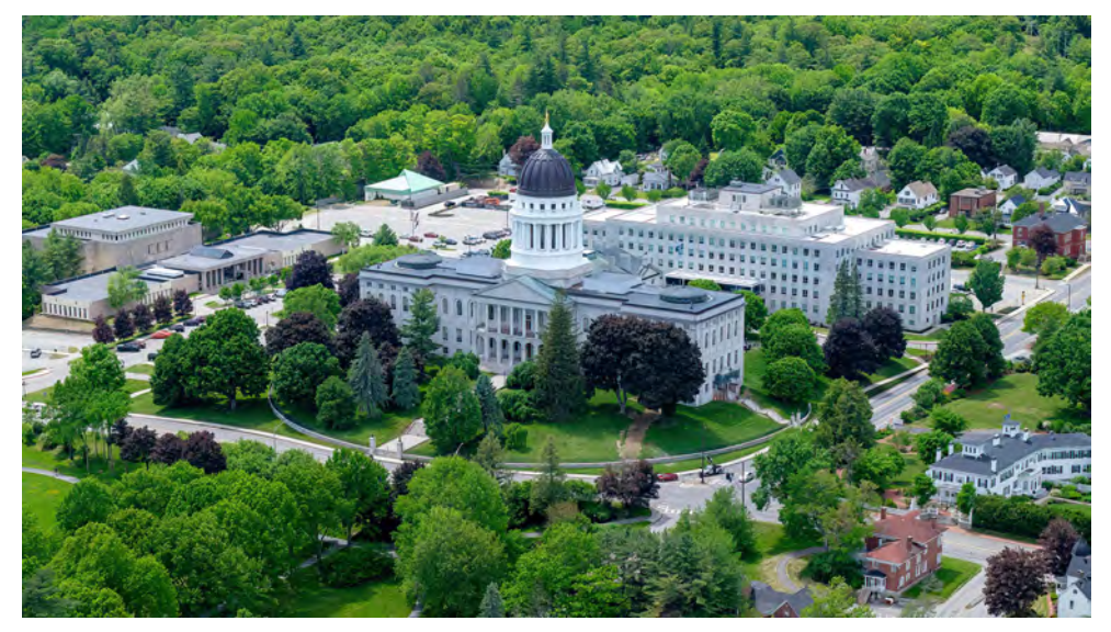
Maine State Capitol, the Sausage Factory

If that were the case, any degradation that might occur would be measured from Class C (5 parts per million [ppm] dissolved oxygen [DO] minimum)