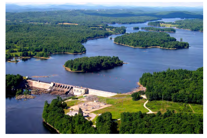
Gulf Island Pond, Androscoggin River. (Photo not in original article.)

While we've long known that coal and gas-fired power plants emit troubling amounts of greenhouse gases, research has found that reservoirs can emit significant amounts of methane, too—which has a global warming potential 85 times that of carbon dioxide over 20 years—along with smaller amounts